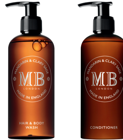
Hair & Body Wash Conditioner