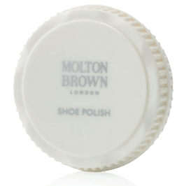
Shoe Polish (Resealable)