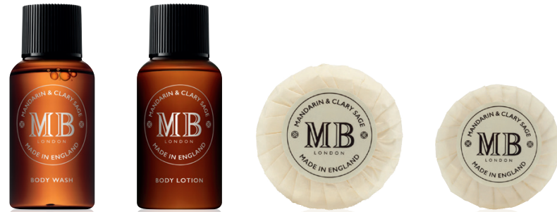
Body Wash Body Lotion 50g Soap 30g Soap