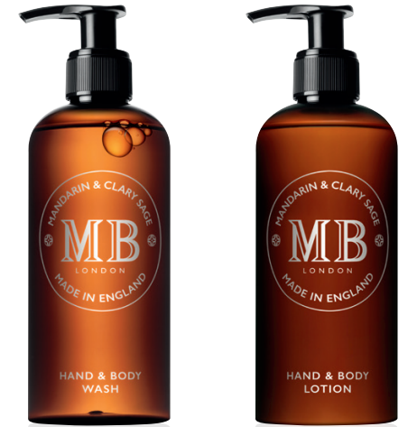
Hand & Body Wash Hand & Body Lotion

Available in 30ml (1fl oz) and 50ml (1.7fl oz)